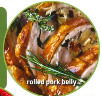
rolled pork belly

simply heat + eat save time + money gluten-free + vegetarian options