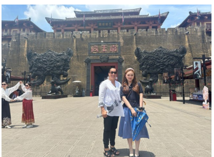
Hengdien World Studios