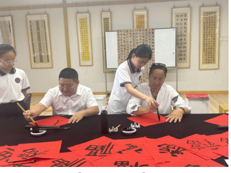
Drawing Chinese Characters