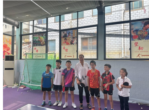
Table Tennis Champs