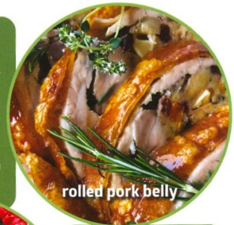
rolled pork belly

simply heat + eat save time + money gluten-free + vegetarian options