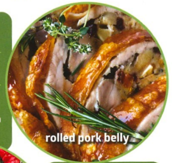
rolled pork belly

simply heat + eat save time + money gluten-free + vegetarian options