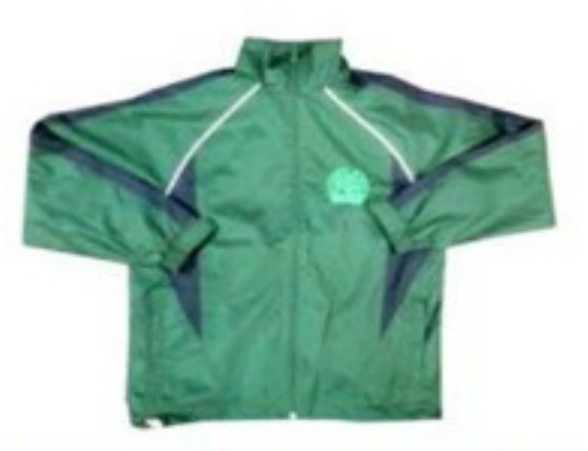
Lynmore Primary Jacket Bottle Was $75.00 Now $60.00