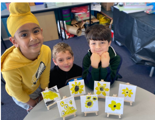
What beautiful paintings for Daffodil Day...