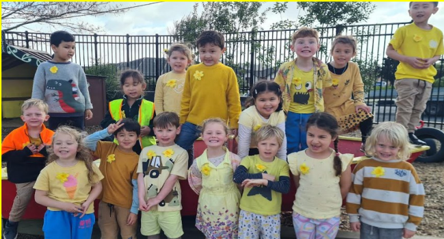
Kupe 0 students dressed in yellow to support Daffodil Day...more photos further on!

Drawing on meaningful connections to our hauora, whenua, iwi, hapū and whānau, we empower our students to become compassionate and well-rounded individuals.