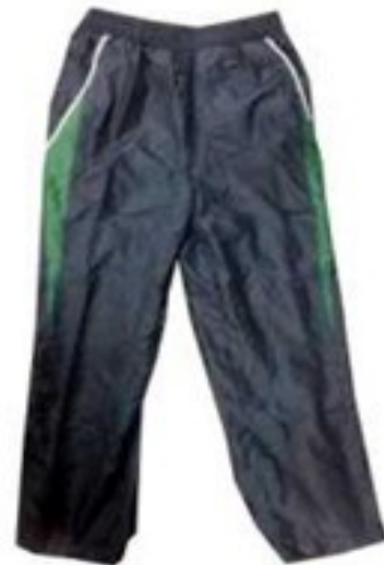
Lynmore Primary Track Pant Was $60.00 Now $50.00