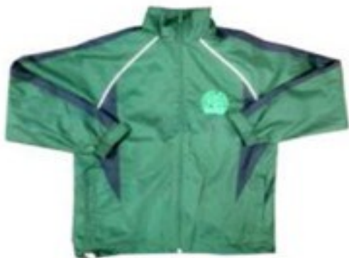
Lynmore Primary Jacket Bottle Was $75.00 Now $60.00