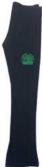
Lynmore Primary Girls Bootleg Was $55.00 Now $45.00