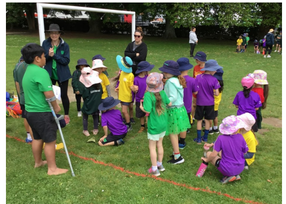
PHOTOS FROM JUNIOR ATHLETICS Run, Jump, Throw...