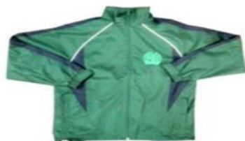
Lynmore Primary Jacket Bottle Was $75.00 Now $60.00