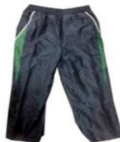
Lynmore Primary Track Pant Was $60.00 Now $50.00